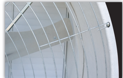
Heavy duty guard is hot dip galvanized after welding to protect from corrosion.