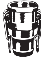
PART "C" FEMALE (Hose Shank)