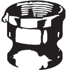
PART "A" MALE