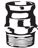
PART "F" MALE