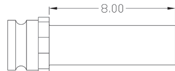
Tube Stub Adapters