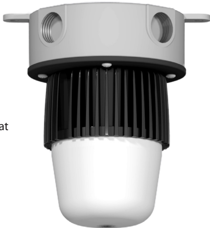
Junction Box Format